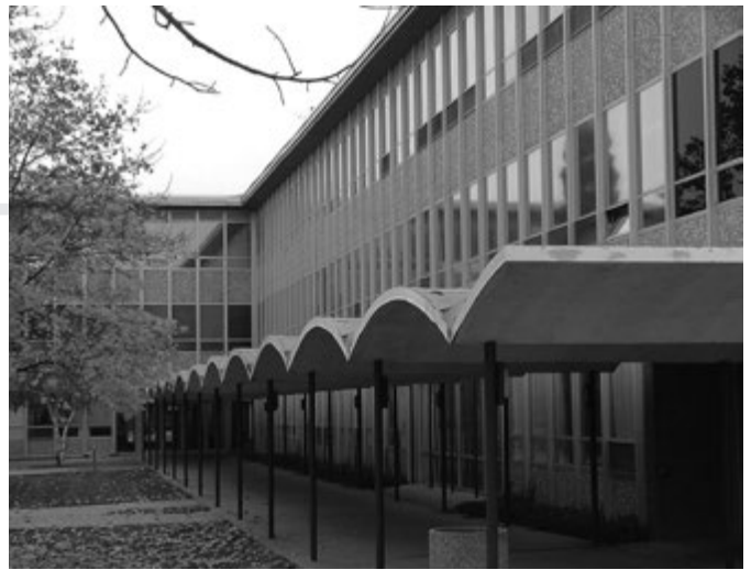
Milton Bennion Hall, built 1959.

Utah Heritage Foundation's loan program recently helped fund a project in the Avenues Local Historic District allowing a property owner to uncover a window, clean the brick, and also rebuild the historic wood porch. Information about the original front facade and porch was obtained using a historic photo.