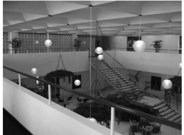
This picture shows the lobby of a building designed by Architect Edward Durell Stone for Stuart Pharmaceuticals. This building is part of a sleek Neo-Formalist plant and office complex built in Pasadena, CA in 1958.