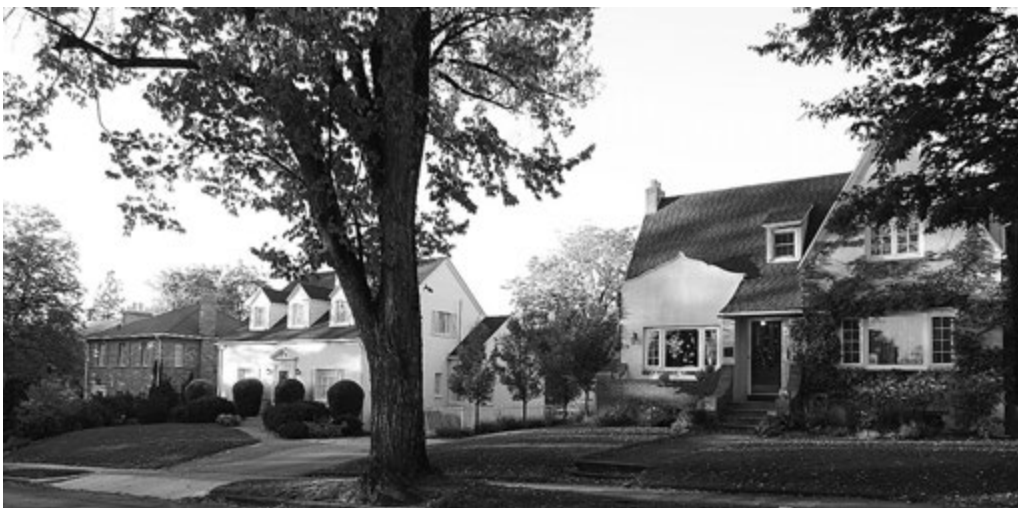
Homes in the Normandie Heights neighborhood offer a wide variety of architectural styles.