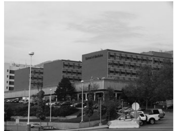
School Of Medicine, built 1965.