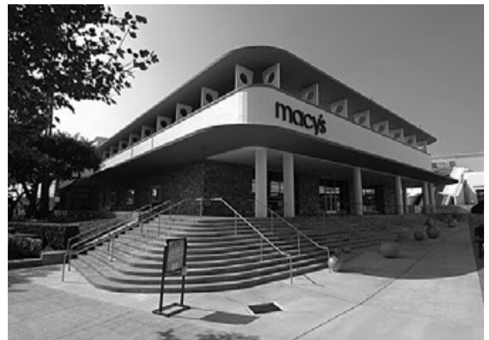
Engineered to meet the precise aspirations of residents of Pasadena, Bullock's Pasadena (currently Macy's) is a sublime example of a post-World War II department store.