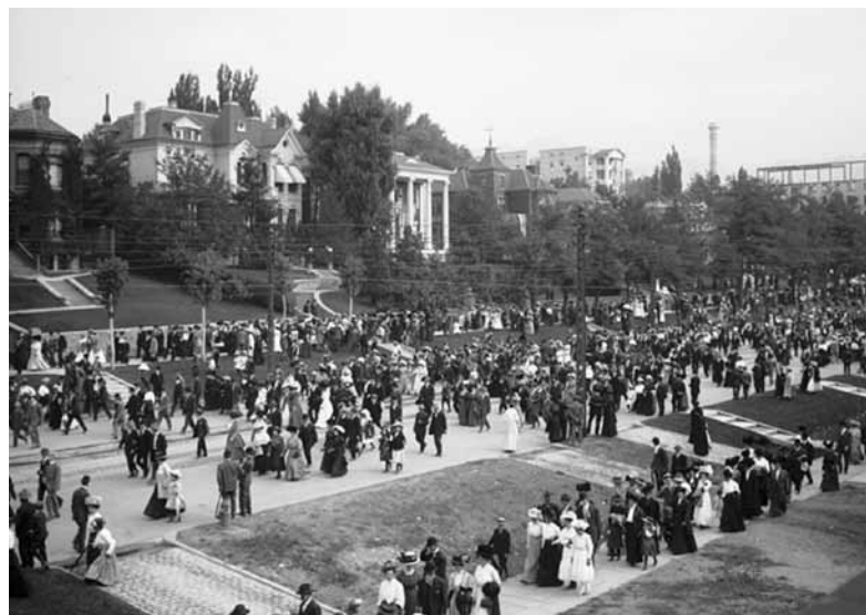
People gathered on South Temple following a parade in honor of U.S. President Taft in 1909.

dium of religious and non-religious buildings: Mormon and Masonic Temples, Presbyterian and Catholic churches, historic fraternal clubs, and stately homes of a bygone era.