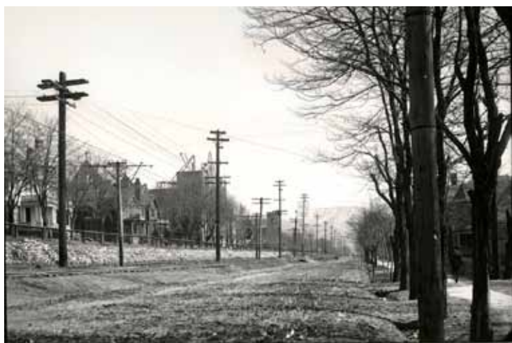
South Temple as it is prepared for paving ca. 1904.

Originally a dirt road, South Temple developed as a stately residential street as mining became an economic powerhouse in Utah. The wealthiest families built their mansions here and today it is home to the world's richest compen-