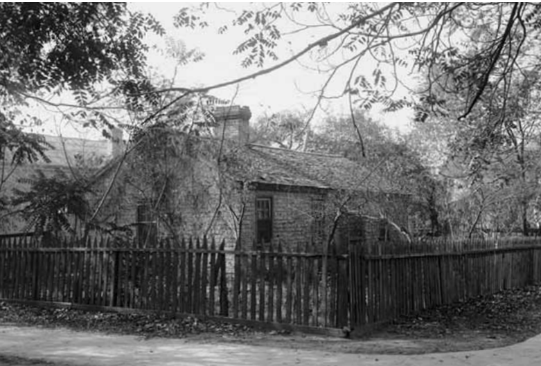
An old adobe at 75 North 300 West, SLC, now demolished. Photographed in 1910.

Adobe was just clay mixed with water and chopped grass or straw and packed into molds. Good quality clay wasn’t hard to find; the 1869 Salt Lake City directory mentions “large adobe yards,” the oldest probably just west of Pioneer Park.