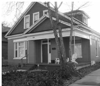
Charles Northrup Woodard House.

Adobe was just clay mixed with water and chopped grass or straw and packed into molds. Good quality clay wasn’t hard to find; the 1869 Salt Lake City directory mentions “large adobe yards,” the oldest probably just west of Pioneer Park.