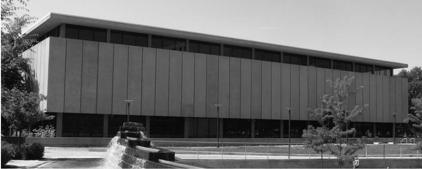
The original concept of a solid cube floating between two transparent planes of glass has been maintained faithfully since its construction.