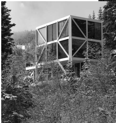
The Mooney/Sparano house (above) as seen in Emigration Canyon.