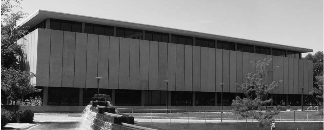
The original concept of a solid cube floating between two transparent planes of glass has been maintained faithfully since its construction.